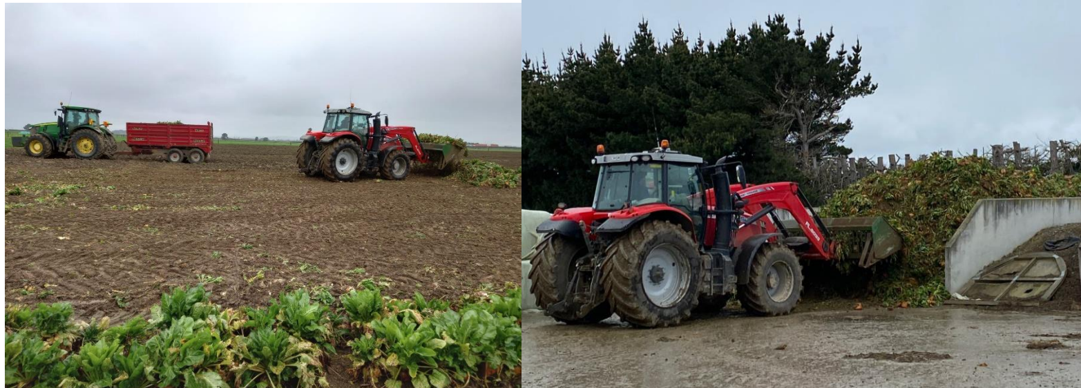
Figure 2. Fodder beet lifting this week